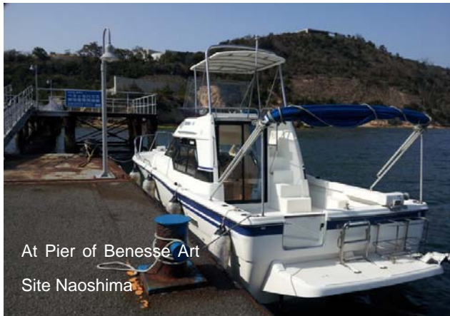
At Pier of Benesse Art Site Naoshima

*You can book this exclusive service almost anytime as it is private cruise, however the booking itinerary might be cancelled/changed due to the rough weather conditions.